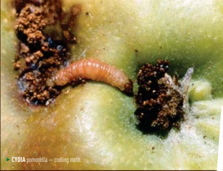
► CYDIA pomonella — codling moth.