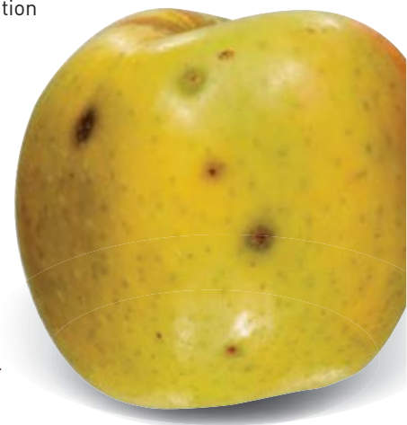
► MEDFLY damage.