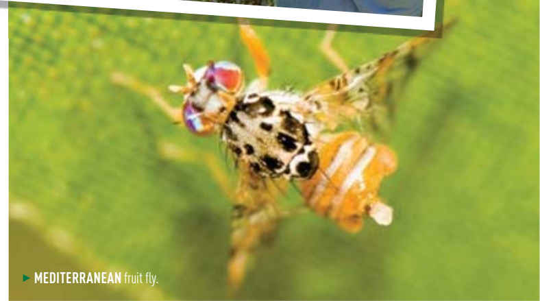
► MEDITERRANEAN fruit fly.

Accreditation of a Systems Approach for domestic market access is normally done by the national Subcommittee on Domestic Quarantine and Market Access (SDQMA) and for international market access via the Department of Agriculture and Water Resources (DAWR) and the bilateral agreement process between countries.