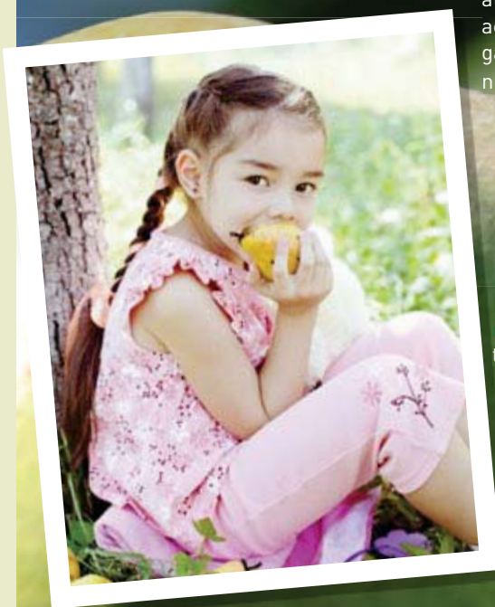
► THE future of the industry requires growers to continue work together to improve eating experiences for the consumer.

This type of news is a terrible blow for the industry as a whole — as we all know growing fresh produce is not easy at the best of times, let alone having an act of nature to completely change the game for a season is a situation that nobody would like to be faced with.