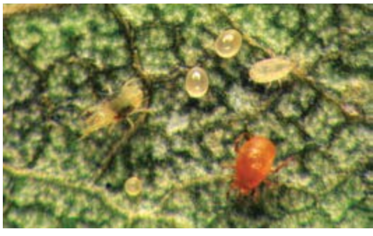
TOP: Plum rust mite being consumed by a naturally occurring sigmaeid predatory mite.

ABOVE: Two-spotted mite and circular eggs and introduced predatory mites and their ovoid eggs.